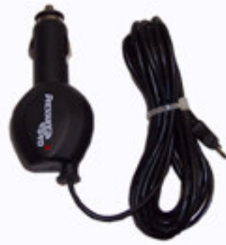
Power Cord – Fixed End - Lighter Accessory $10.00