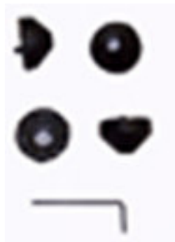
Sensor Locks - $5.00 ea