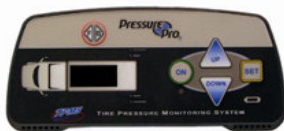
Commercial Truck Monitor (Up to 34 Wheels – Requires Cabled Antenna) Monitor with Cabled Antenna $235