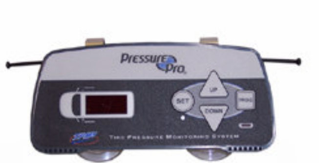
Auto/Lt. Truck/SUV/Bus Dipole Monitor (NO TOW) Monitor $175