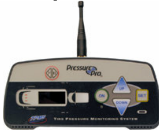
RV/TOW MONITOR – MONOPOLE - $190