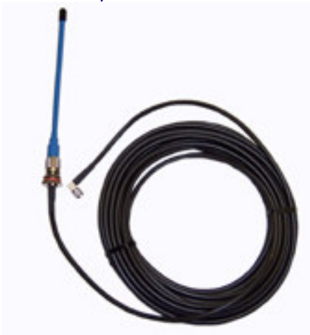
Cabled Antenna $40.00