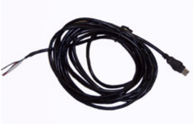
Power Cord – Stripped End (Hard Wire) $8.00