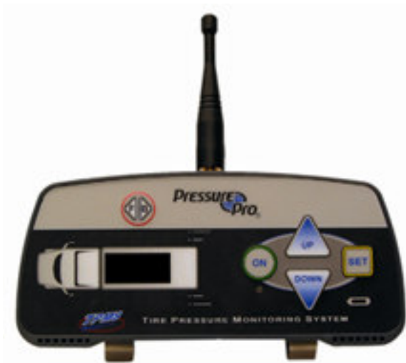
Light/Medium Duty Truck Monitor (up to 18 Wheels) Monitor $190