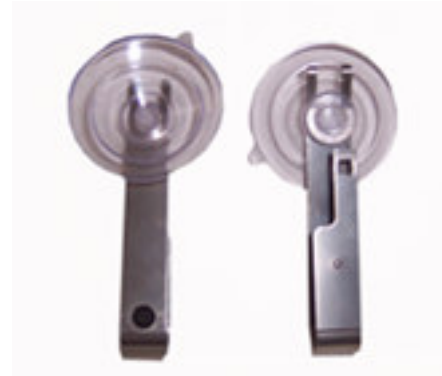
Visor Clips with Suction Cups $9.00